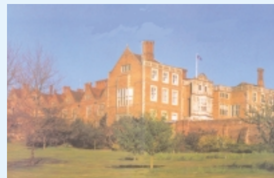
Bramshill Police College

Speaking after the presentation the Deputy Chief Inspector said: "While the scale of the conflicts cannot be compared there are many lessons to be learned from a closer examination of the 'Troubles' and the processes that are required to