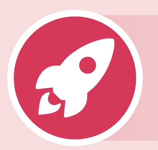
Launched in Plymouth in 2011